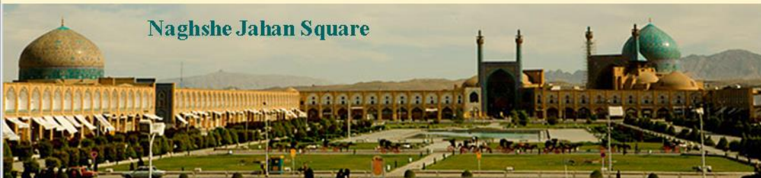
Naghsh-e Jahan Square