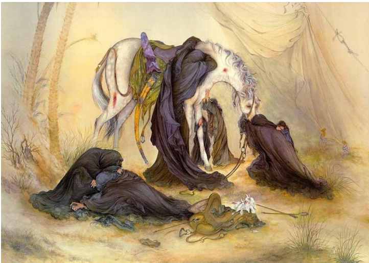
The Picture of Asre Ashura By Farshchian